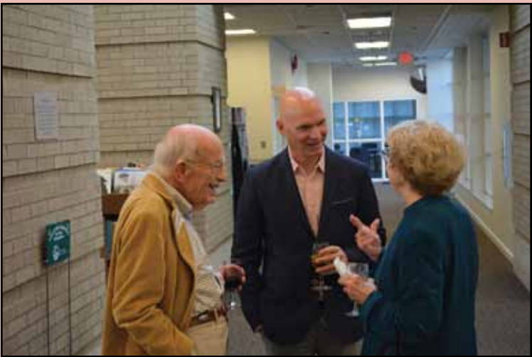
Anthony Doerr chats with guests at the October 11 reception and book signing.

Thanks to our generous Friends of the Library organization for donating the prizes.